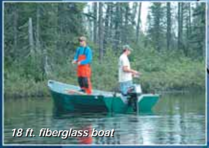
18 ft. fiberglass boat