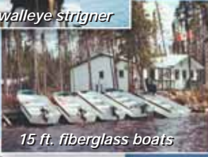
15 ft. fiberglass boats