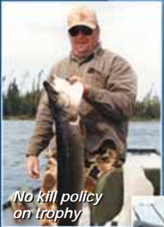
No kill policy on trophy