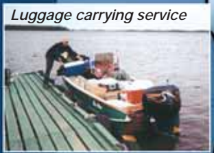
Luggage carrying service