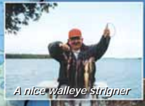
A nice walleye stringer