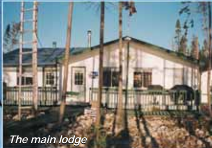
The main lodge