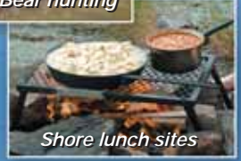
Shore lunch sites